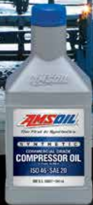
SYNTHETIC COMPRESSOR OIL