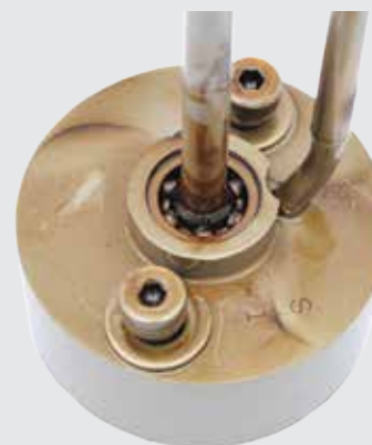
AMSOIL SYNTHETIC MULTI-VISCOSITY HYDRAULIC OIL (ISO 46)