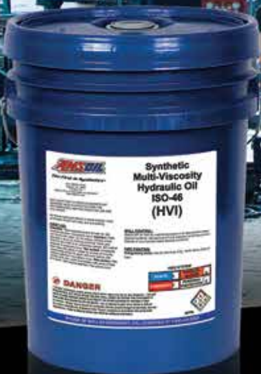
SYNTHETIC HYDRAULIC OIL