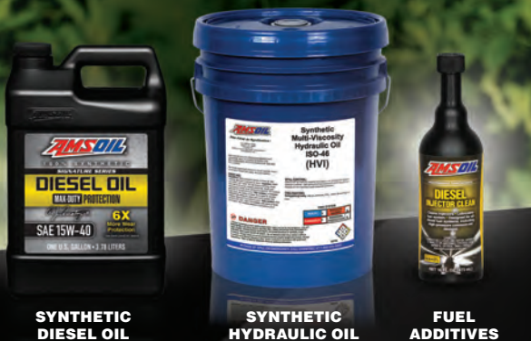
SYNTHETIC DIESEL OIL