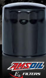
AMSOIL E3 FILTERS