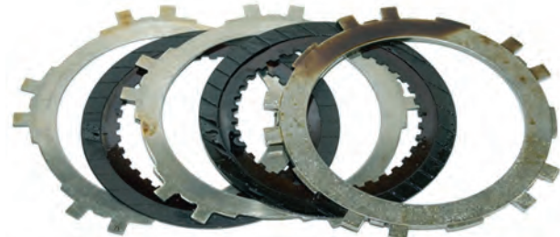
Automatic transmission clutch plates after cleanup with AMSOIL Engine and Transmission Flush reveal lighter glazing and varnish.