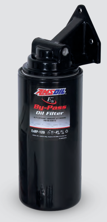
Fittings and hardware not shown

The Heavy-Duty Bypass Filtration System is constructed of high-quality cast aluminum with a steel filter spud that has been thoroughly tested in on-road and severe off-road service. The mount is finished with a thick layer of powder-coated paint to provide maximum resistance to the degrading effects of road salt, debris and engine-compartment chemicals.